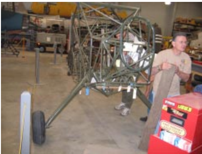
Its on wheels

Less is not always more. The rebuilding of the 1942 Stinson L5 at Yanks Museum is progressing slowly because the cotter pins readily available today are NOT what was used in the original construction of the L5. Progress is slowed by the desire to build to "Golden Wrench" standards using volunteer efforts on Saturday mornings. Obtaining some of the factory original parts has caused delays. The plane has changed significantly since work started.