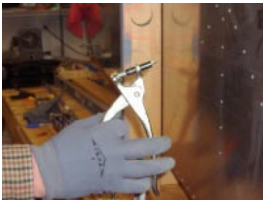
4. Position cleco.