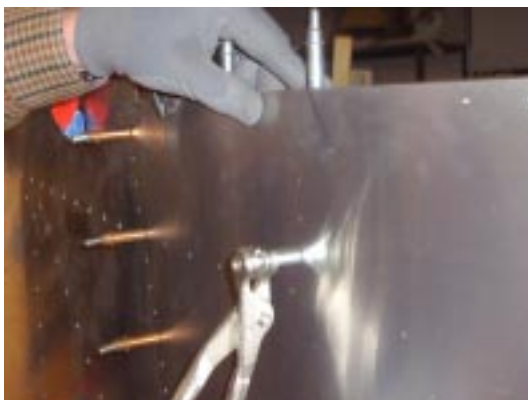
6. Cleco inserted.