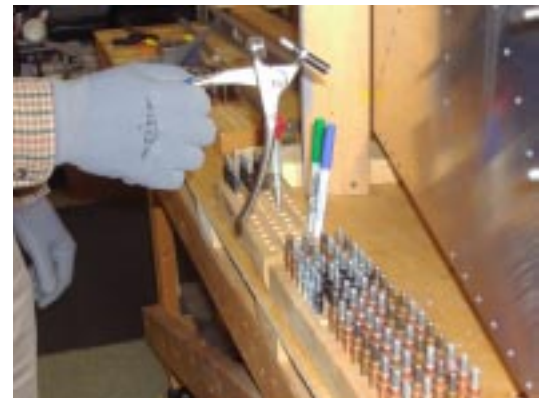
3. Check the cleco.