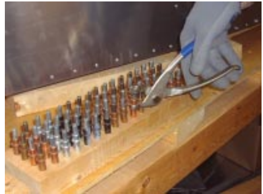
1. Select a cleco.